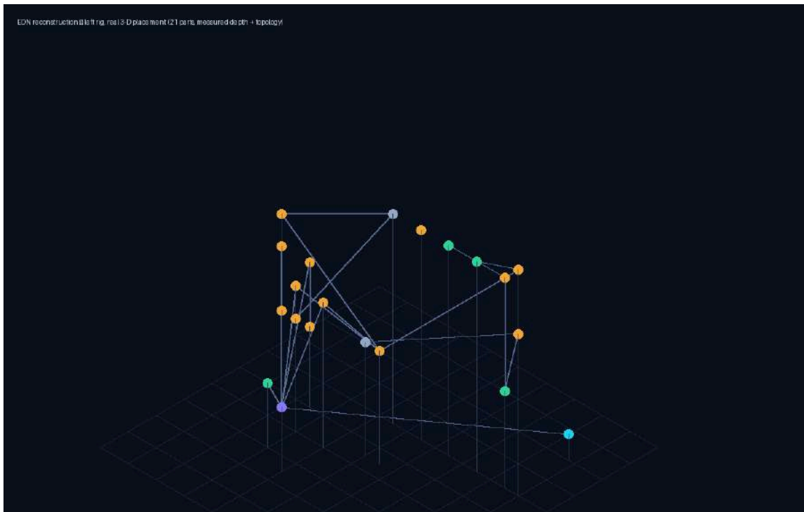
Figure 1 — an EON reconstruction of the reference rig: parts placed at measured 3D poses with topology. Depth is real, not inferred.